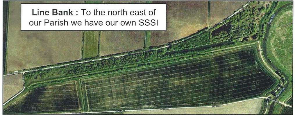
Line Bank : To the north east of our Parish we have our own SSSI

Originally known as Lyone Bank, and now known as Line Bank. Just beyond the flood bank (the area of woodland and ponds seen in this aerial photo) is an area designated a Site of Special Scientific Interest (SSSI). In the UK, an SSSI is a formal conservation designation that describes an area of particular interest to science due to the rare species of fauna or flora it contains, or because of important geological or physiological features that may lie in its boundaries. Ours is one of the best remaining examples of eutrophic open water, marsh, open water and base-poor fen communities in Nottinghamshire. Some weeks ago, Mick Hickman, an accomplished local amateur photographer made the following important report about the Owls who use our countryside as a habitat and breeding ground. Mick has agreed to share it more widely here.